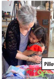
Pillowcase dresses for the girls of a children's home near Manila