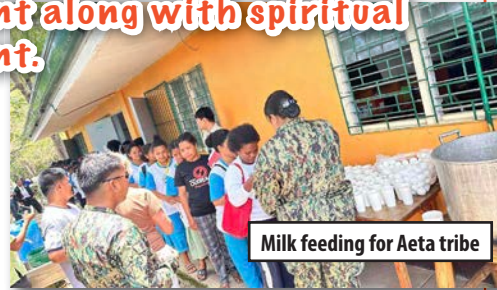
Milk feeding for Aeta tribe

Please make this an object of prayer and, if it is His will, send your love offering to PO Box 2587, Texarkana, TX 75504 or give online at www.icplit.org