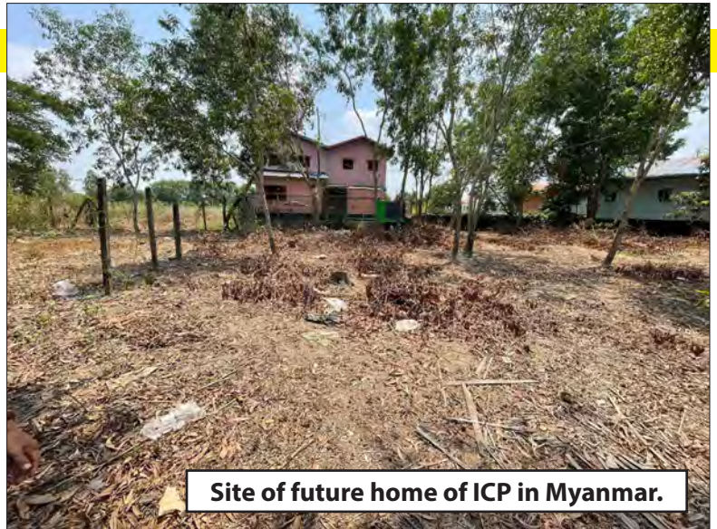
Site of future home of ICP in Myanmar.