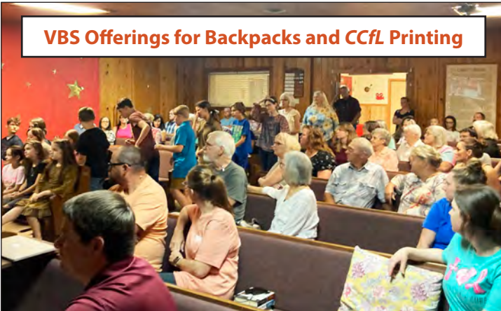
VBS Offerings for Backpacks and CCFL Printing