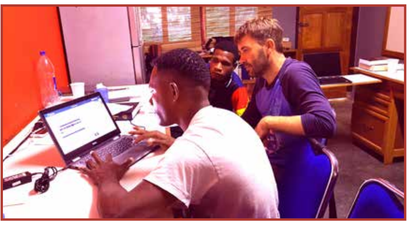
Translators must have computer skills.

We look forward to the opportunity to place a copy of the entire Bible in the hands of these people, who make their home in the very remote jungles of one of the most remote islands in the world: Papua, Indonesia.