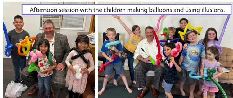
Afternoon session with the children making balloons and using illusions.