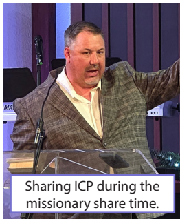
Sharing ICP during the missionary share time.